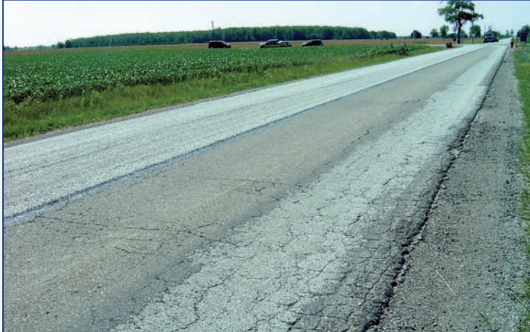
Existing cracked surface before FiberMat™.