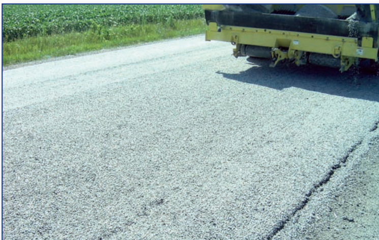
Aggregate protects FiberMat™ from traffic.

Norjohn Contracting and Paving Limited is proud to be the Ontario distributor of FiberMat™, the ultimate crack inhibiting membrane.