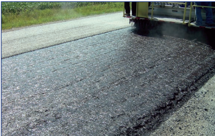
Placement of FiberMat™ membrane.